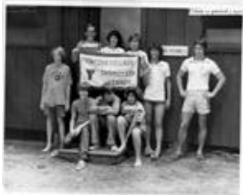
Cabin 17 Pd 3 1972