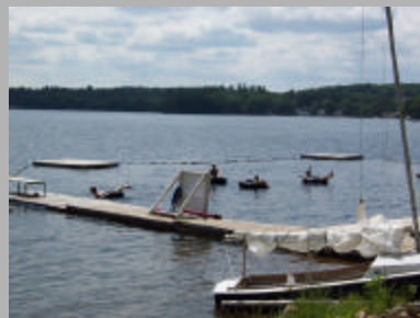
Enjoying Halfmoon Lake