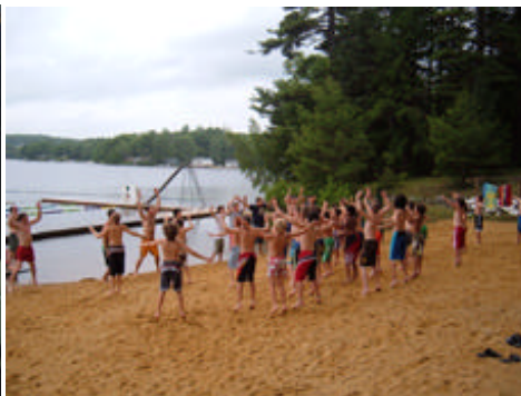
Everyone to the waterfront for calisthenics