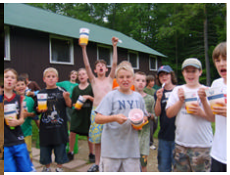
Would you like some?