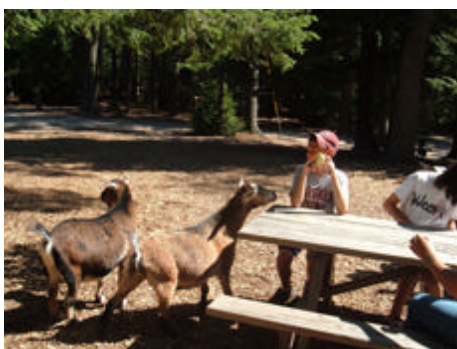
Chico and Peanut looking for a paper snack