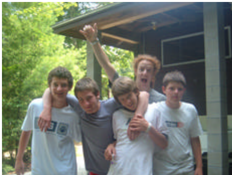
Hanging out with friends