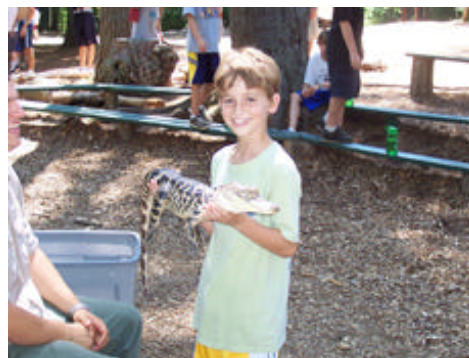
Rainforest Reptiles visit