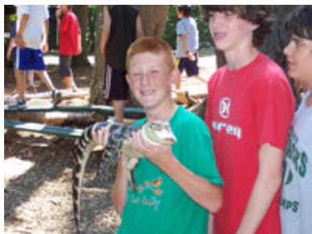
Mom can I keep him?